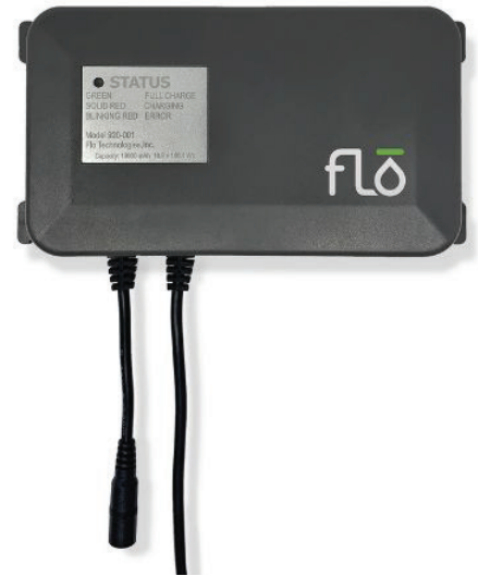
Flo by Moen™ Lithium Ion Battery Backup Model: 920-001

* Please note that applicable laws and regulations require that these materials be shipped via ground transportation rather than air.