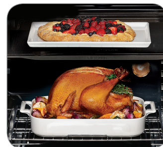
Flex Duo™ Oven