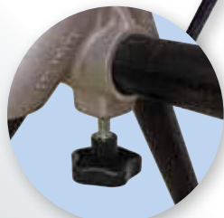
FPV20 and FPVBLS