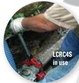
LCRC4S in use