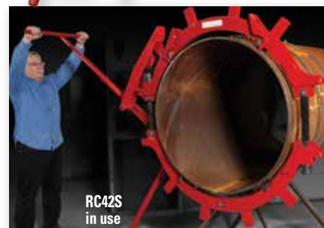
RC42S in use