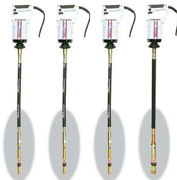
0.90" dia. head 1.10" dia. head 1.25" dia. head 1.5" dia. head

The sealed fan acts as a suction for air taken in from the rear, passed over the motor for cooling, and discharged at the rear again.