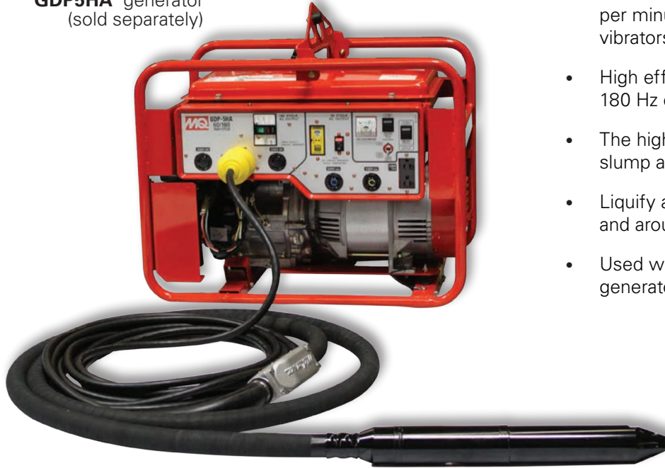
VIBRATOR FXA60A4 2 3/8" diameter head