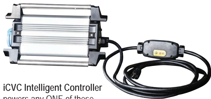
iCVC Intelligent Controller powers any ONE of these vibrators:

The Intelligent Controller monitors RPM and frequency under changing conditions, protecting the vibrator from failure due to current surge, broken wires or short circuits; this virtually eliminates failures.