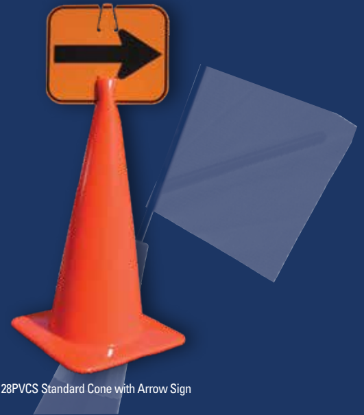
28PVCS Standard Cone with Arrow Sign