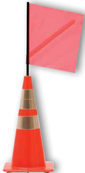
28" Reflective Cone with Flag Adapter and Flag