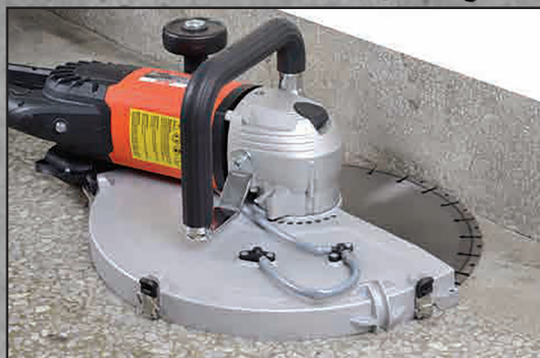
Removable guard side for flush cutting*