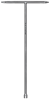
H-10321 Shut-off rod

Lengths: 2', 3', 4', 5', 6', 7', 8', 10', and 12'