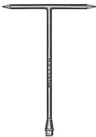
H-10356 Combination key

Used to open clogged Buffalo type curb boxes quickly and easily. Eliminates digging up box to reach the curb stop. One end of the handle is pointed for digging ice or dirt away from lid of box. Rod and crossbar handle are made of steel and auger spiral is made of malleable iron.