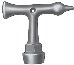
H-10323 Pentagon key - Ductile iron

For use with Buffalo type curb boxes to remove screw in lid and operate stationary shut-off rods. Will not fit tee head of curb valves or stops.