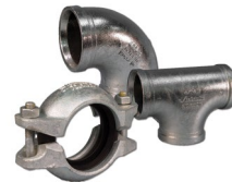
Shouldered Ends Publication 07.06