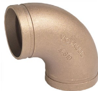
Copper Publication 22.04