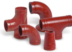
Ductile Iron for AWWA size pipe Publication 23.05