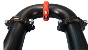
XL fittings for abrasive services Publication 07.07