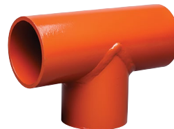
Plain End Publication 14.04