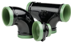
Extra Heavy EndSeal "ES" Publication 07.03