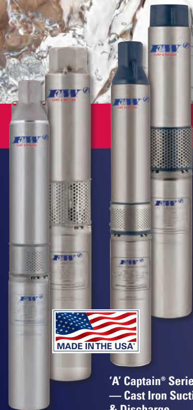
'S' Commander® Series — 304 SS Suction & Discharge