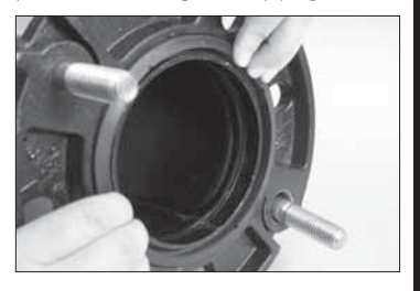
5a. Make sure the gasket is seated properly in the flange adapter.

5. INSERT MATING BOLTS: Insert a standard, full-shank diameter assembly bolt through each of the two mating holes in the flange adapter. This will maintain the position of the flange in the pipe groove.