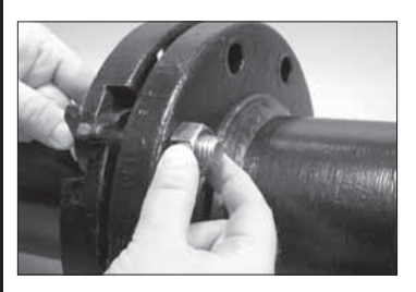
6a. Thread standard flange nuts fingertight onto the two mating bolts.