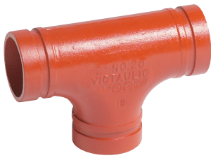
No. 20 Tee