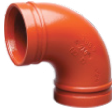
No. 10 Elbow