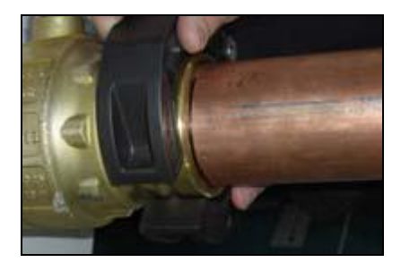
G. Open the XL ring and place at right angle on the fitting. The XL ring must be engaged on the fitting bead. Visually check the insertion mark to ensure the tubing has not moved.