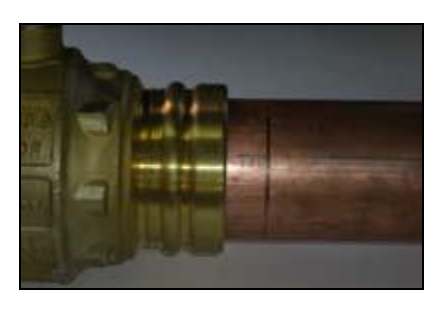
E. While turning slightly, slide the press valve onto the tubing to the fitting stop. Note: end of tubing must be fully inserted.