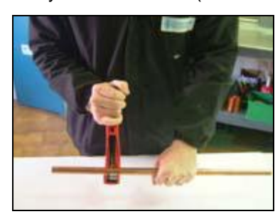
A. Cut copper tubing at right angles (using displacement type cutter or fine-toothed steel saw).