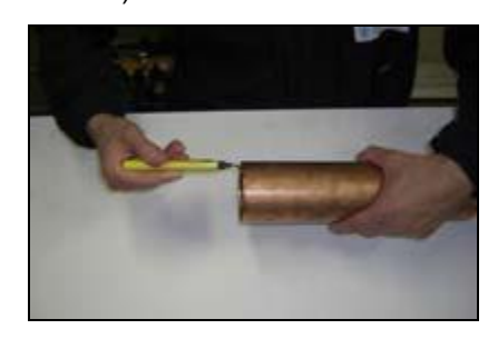
B. De-burr tubing on the inside and outside to prevent cutting of the valve's o-ring seals.