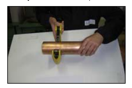
A. Cut copper tubing at right angles (using displacement type cutter or fine-toothed steel saw).