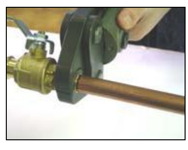
H. Start the pressing process and hold the trigger until the jaw has engaged the fitting.