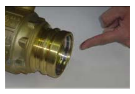
D. Check seal and grip-ring for correct fit. Do not use oils or lubricants. Use only the valve's black EPDM o-ring seals.