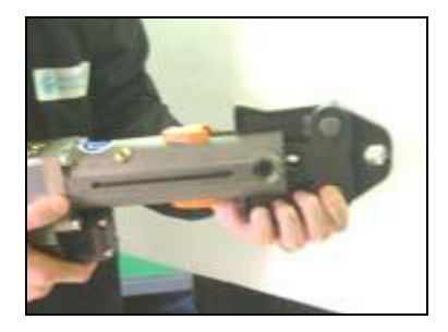
F. Insert the appropriate jaw into the pressing tool and push in holding pin until it locks into place.