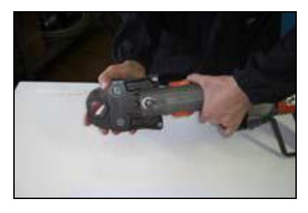
F. Insert the actuator into the pressing tool and push in the holding pin until it locks into place.