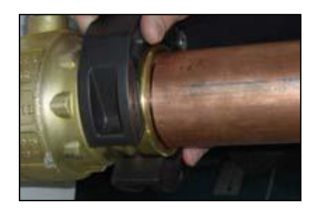
J. After pressing, the actuator can be opened again. Remove the XL ring from the fitting on completion of press.

12. Before use, pressure-test the system in accordance with local codes.