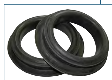
"Pop In" Resilient Seats