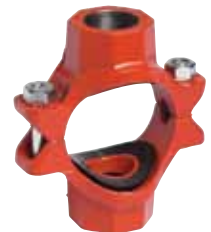
STYLE 920 CROSS