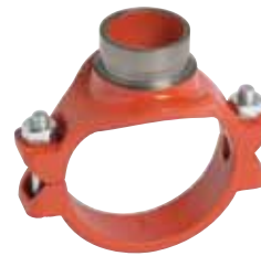
STYLES 920 AND 920N

Additionally, the Vic-Tap II ® hole cutting tool, which allows for hole cutting capabilities on pressurized systems, utilizes the Style 920 Mechanical-T in conjunction with the Series 726 Vic-Ball Valve to create the Style 931 Vic-Tap II Mechanical-T unit. See page 8 for further information.