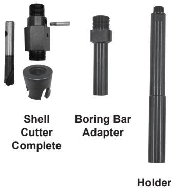
Shell Cutter Complete

For 14" PVC pipe and larger only use Mueller power operator with automatic feed. Power operator must turn Boring Bar and feed yoke assembly at the same time.