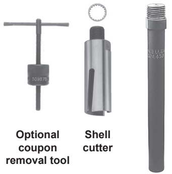
Optional coupon removal tool