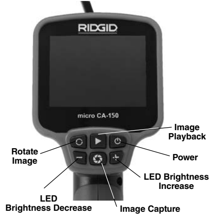
Figure 2 – Controls