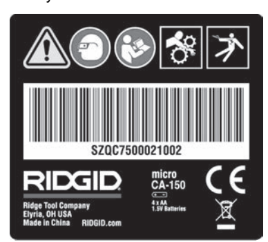
Figure 7 - Warning Label