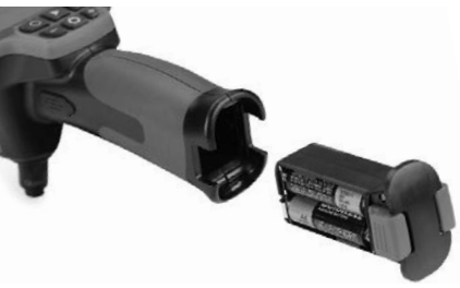
Figure 4 - Battery Compartment