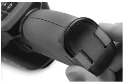
Figure 3 - Battery Compartment Cover

(See Figure 4). If needed, remove batteries.