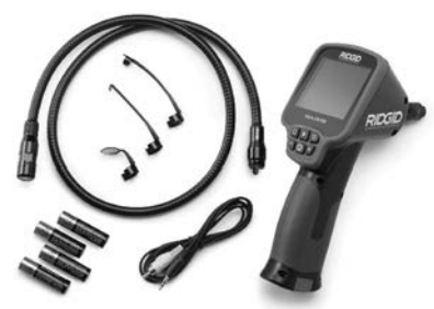
Figure 1 - micro CA-150