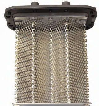
Large Built-in Z-Plate Strainer