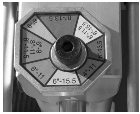
This stop position (at bottom) is set to squeeze 6" 15.5 DR pipe. Stops on both sides of tool must match for proper use. And, desired setting must be in this bottom orientation.

Select both pipe stops based on pipe diameter and SDR. Position both pipe stops so that the corresponding flat is facing the bottom squeeze bar. Stops must match one another and chosen setting must be in bottom orientation on both sides.