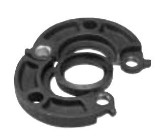
2 - 8" Sizes