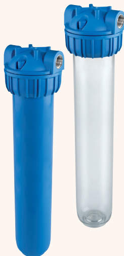
20" Three Piece Filter Housing