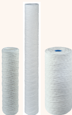
Wound Polypropylene Thread