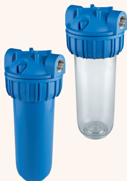
10" Three Piece Filter Housing