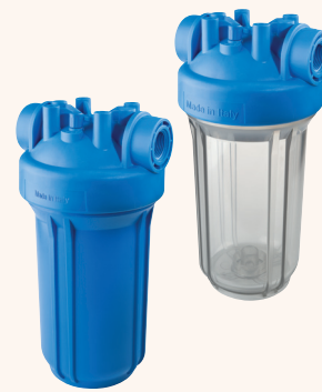
10" Big Filter Housing