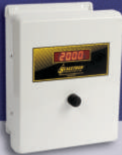
4-1/2 Digit Indicator (Standard)