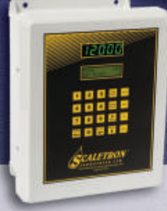
1099™ Chemical Process Controller (Optional)