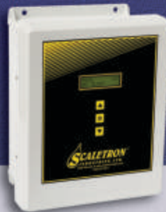
1020™ 5 Digit Controller (Optional)