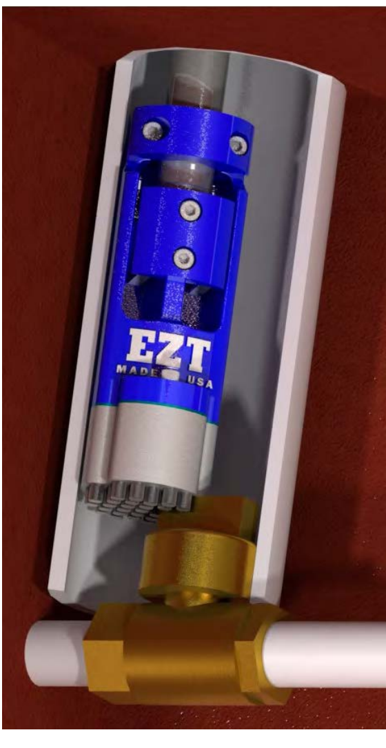
MAX RATING: 80 FT-LBS