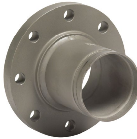
No. 445F and No. 445R Flange Adapter Nipple 1 ¼ – 12"/DN32 – DN300