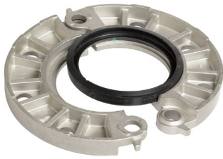
Style 441 Vic-Flange 2 – 6"/DN50 – DN150