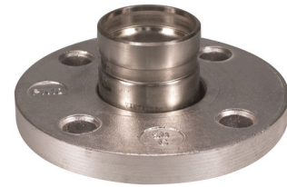
No. 441N Van Stone Flange Adapter 2 – 12"/DN50 – DN300