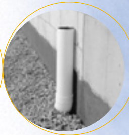
Downspout and Foundation Drainage

Hancor Service: Hancor representatives and engineers are committed to providing you with the answers to all your questions, including specifications, installation, backfill recommendations and more.