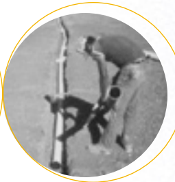
Golf Courses and Area Drainage