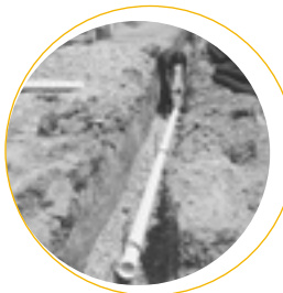
On-Site Waste Management