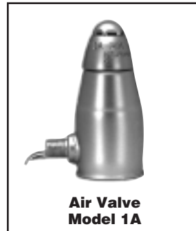
Air Valve Model 1A