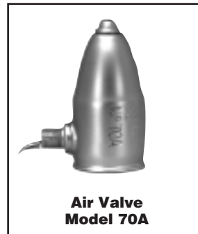
Air Valve Model 70A