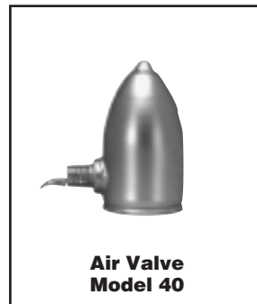
Air Valve Model 40