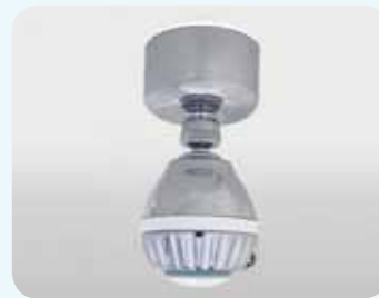
AQ-2125 replacement cartridge for AQ-2100

Model: AQ-2125 Rated service flow: 2.5 gpm Max working pressure: 20-100 psi Max capacity: 10,000 gal