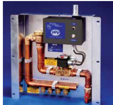
FLUSH MOUNT CABINET