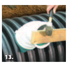
Install pipe fitting. Fitting should sit flush with the surface of the QwikSeal.