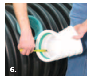
Measure the depth of the fitting to be attached to the pipe stub. See alternative method below.