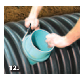
Install the band clamp at 60 in-lbs. torque.