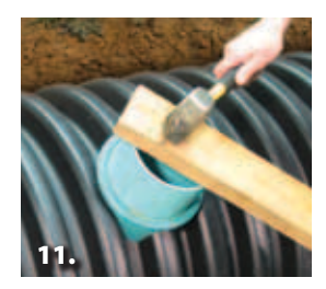
Using a hammer and block of wood, drive the pipe stub to the QwikSeal pipe stop.