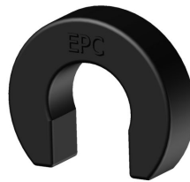
Figure 2 TECTITE Removal Tool