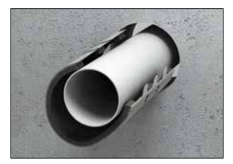
1. Wrap the sleeve around the pipe

The Pacifyre® MK II Fire Sleeve is installed simply and easily without using special materials. Only one pair of hands is needed for the entire installation.