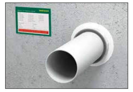
6. Complete the Universal ID Card and place next to aperture.