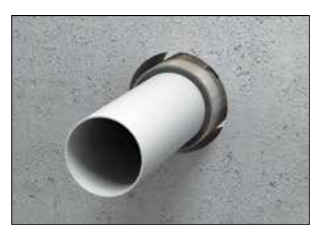
4. Slide the sleeve into the aperture and center it.