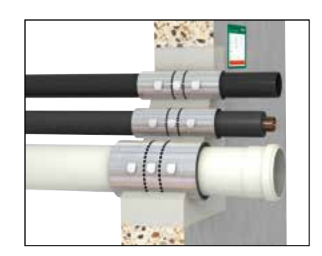
2. Completely finished aperture