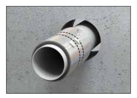
3. Bend and lock closing tabs