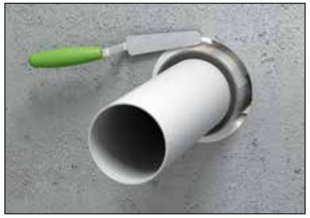
5. Fill the gap with fire-resistant acrylic, foam or mortar