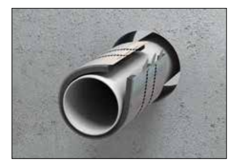
2. Place closing tabs in proper position