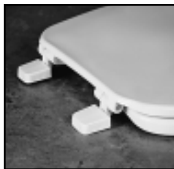
"LOCKED-IN" TOP-TITE® HINGE

Ring thickness is 3/8" Ring thickness including the bumper is 5/8" Height of the seat with cover is 1-1/2"