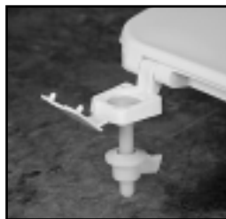
TOP-TITE® HINGES WITH BOLT AND WING NUT