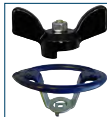
Tee or Oval Handle