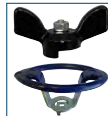
Tee or Oval Handle