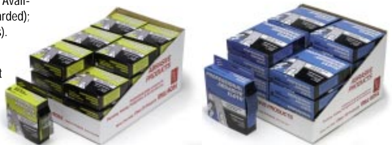
Clean Fit Abrasive Cloth Display/Shippers

Good, economy-grade closed coat abrasive cloth with "J" weight cotton backing. Water resistant. Available in three roll lengths 1-1/2" wide: #70175 (5 yards); #70170 (10 yards); and #70180 (25 yards).