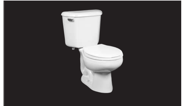
PF3201 / PF3612