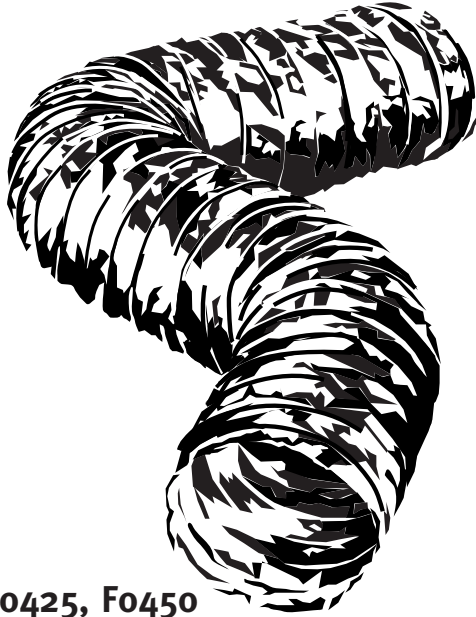
Fo420B, Fo425, Fo450