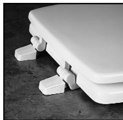
LOCKED-IN TOP-TITE® HINGE