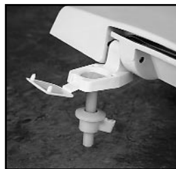
TOP-TITE® HINGES WITH BOLT AND WING NUT