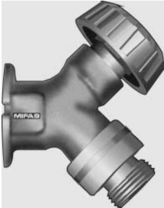
MHY-90 Series wall faucet dimensions