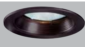
5001TBZ Tuscan Bronze Trim Ring, Tuscan Bronze Baffle