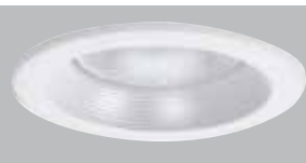
5001P White Trim Ring, White Baffle