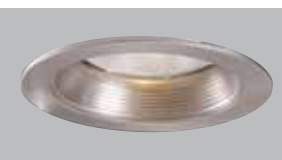
5001SN Satin Nickel Trim Ring, Satin Nickel Baffle