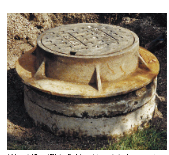
WrapidSeal™ is field cut to minimize waste and reduce inventory.