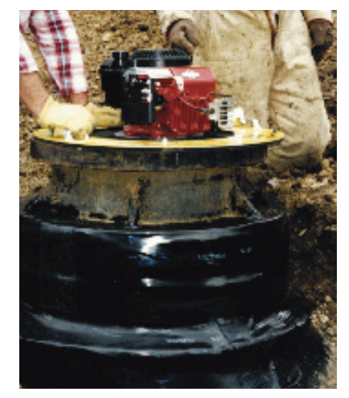
WrapidSeal™ - positive external seal; vacuum tests to 11" Hg.