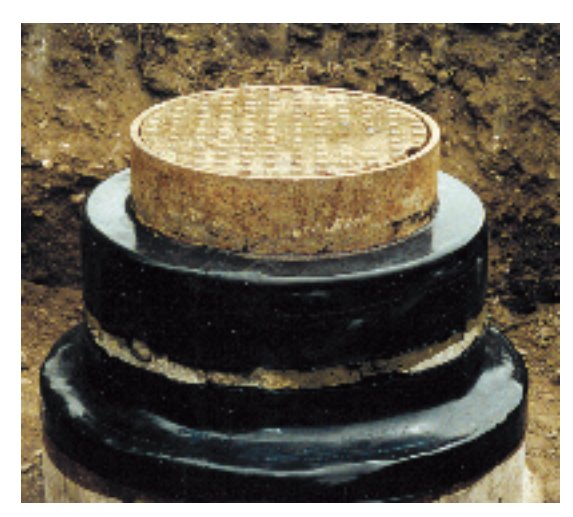
High expansion backing conforms and recovers to irregular structures.