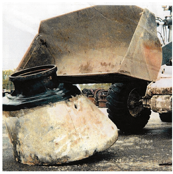
Impact force depicts shear resistance of WrapidSeal™