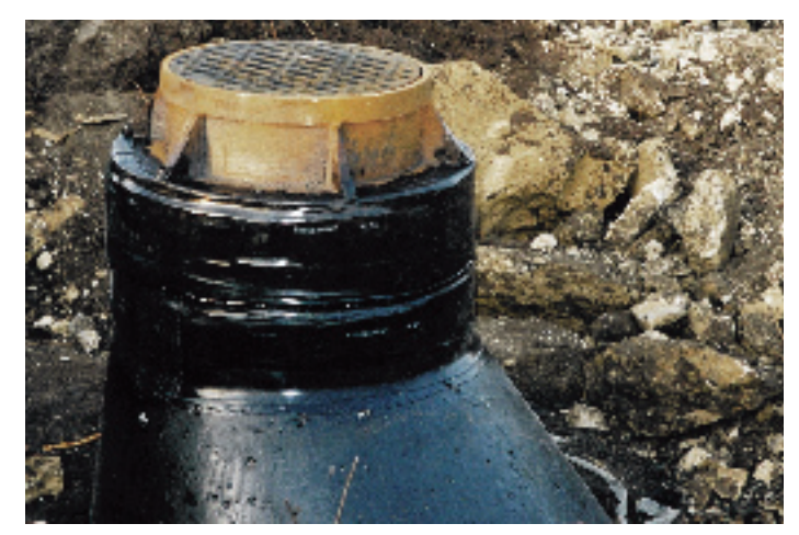
WrapidSeal™ reduces I & I and provides long term manhole integrity.