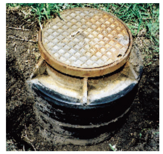
Excellent soil stress resistance after 7 freezethaw cycles.