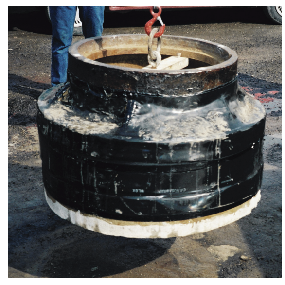
WrapidSeal™ adhesive strength demonstrated with vertical lift.

WrapidSeal™ is an external manhole encapsulation system that effectively seals the joints of a manhole and extends the service life of the structure. This system is made from a unique heat shrinkable thermoplastic material that conforms to the shape of the manhole and forms a tight monolithic seal on the joints. WrapidSeal™ can be used for new construction, or for the rehabilitation of existing manholes to control infiltration through joints and prevent deterioration; thus eliminating costly maintenance repairs and the added expense of treating groundwater.