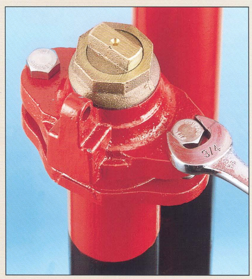
The MainGuard is a high-quality, full-featured 2" blow-off hydrant that saves you money twice.