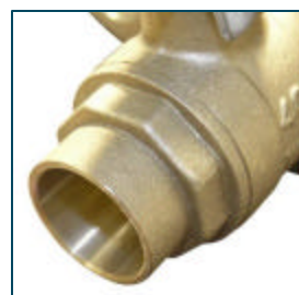
Fig. 475 - Sweat