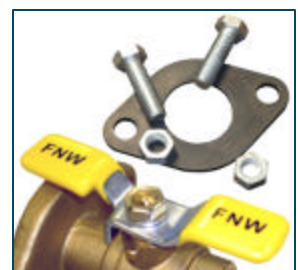
Includes T-handle, Gasket, and Hardware