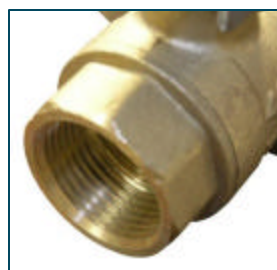
Fig. 470 - FNPT