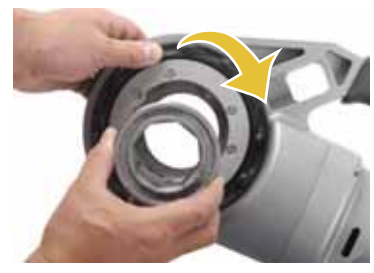
Release to Lock