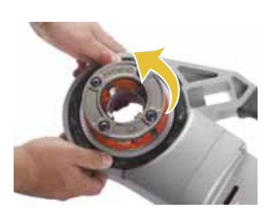
Turn to Unlock