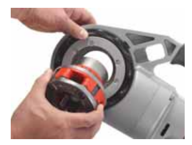
Pull Die Head