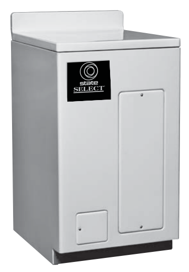
Table Top Electric Water Heaters features convenient flatsurface at 36" height, providing extra "counter space"wherever installed.

All plumbing and electrical connections are made through back of water heater. 27 and 40-gallon tank capacities. Equipped with PEXAN<sup>™</sup> cross linked PEX polymer dip tube.