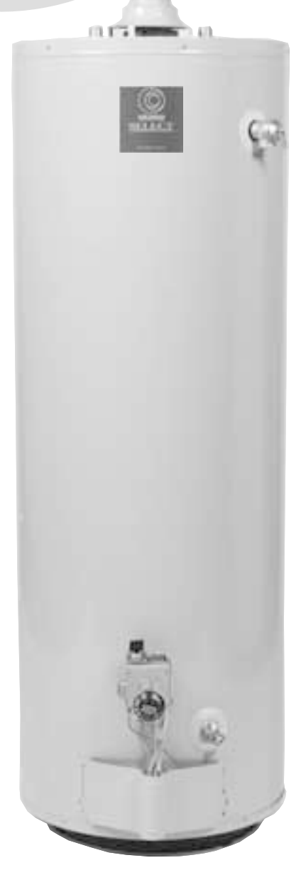
200/201 Series shown

High Efficiency Models Will Qualify for the Upcoming 2009 for the Star Program Energy