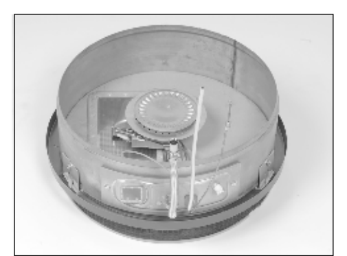
If flammable vapors accidentally enter the combustion chamber, the arrestor is designed so flames burn off the top surface and can not escape down through the arrestor.

Feature a sealed combustion chamber with air intake filter and a flame arrestor built into the water heater base. In addition, a thermal cutoff (TCO) device, is designed to shut off gas flow to the burner and pilot if poor combustion is detected. ANODE ROD*