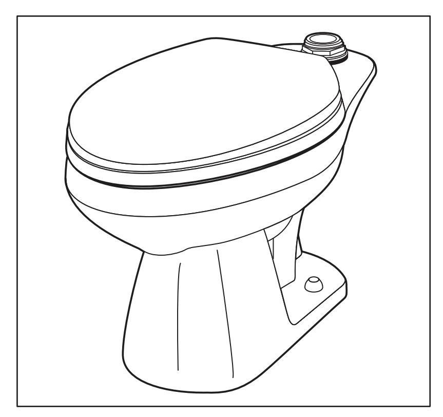
Seat not included