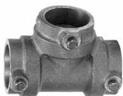
FIG. 7103 - Straight Tee (Sock-It® x Sock-It® x Sock-It®)

NOTE: All Sock-It® fittings are UL/ULC Listed and FM Approved for 175 psi working pressure when used to join XL Pipe and Dyna-Flow Pipe.