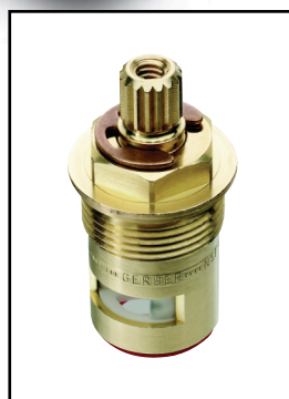
Hex on bonnet allows for easy maintenance