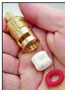
Cartridges can be disassembled to reverse operation