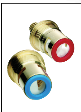
Available in 1/2 turn and 1/4 turn models